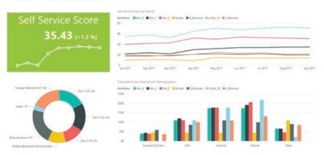
Drill through detailed reports for interactive analysis.