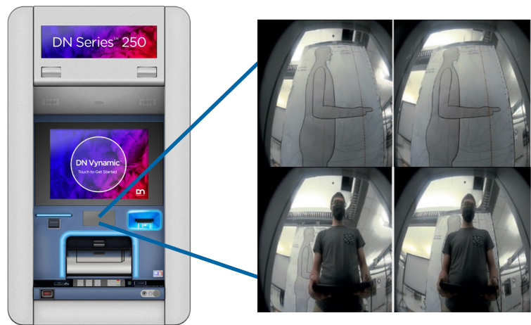
Example of portrait and environment camera image capture from DN 250 camera provision