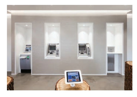
A brighter and more open self-service zone

The result is a bright and generous branch concept that makes optimum use of space and creates a customer and employee-friendly atmosphere.