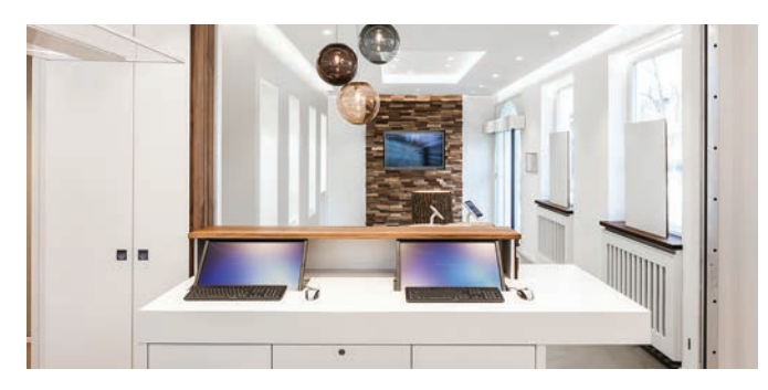
A view from the redesigned teller's station