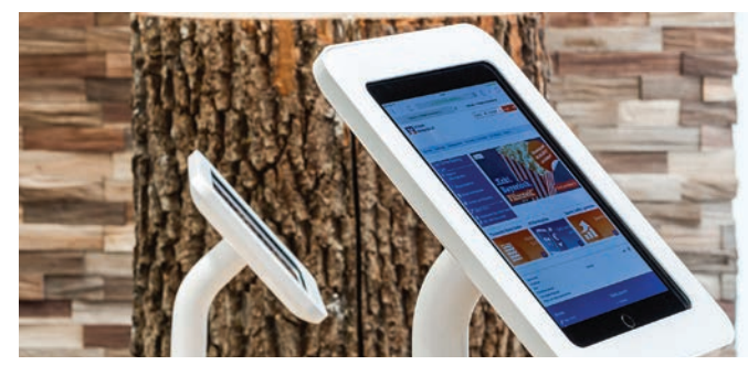
The 140-year-old oak tree trunks adorned with iPads

After hours, the area is covered by a roller shutter. "This was the most reasonable option to secure the foyer because it requires minimal maintenance," explained the architects of Diebold Nixdorf, who planned and oversaw the project.