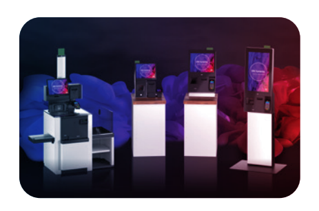
Award-winning product portfolio and state-of-theart technology