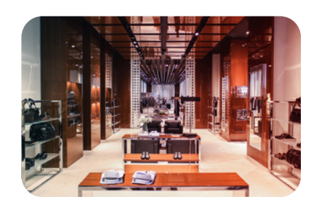
Each of the top 25 retailers in Europe are our customers