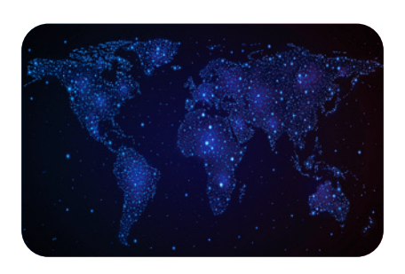
Over 150 partners in more than 100 countries