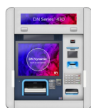
DN Series® 470 Through-the-Wall Drive-Up