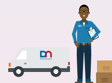
DN Allconnect™ 2nd Line Service