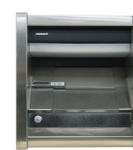
Securomatic® After-hours Depository