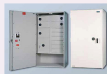
Unencased Safes TL-15 and TL-30*