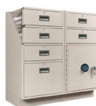
Metal Undercounter Furniture