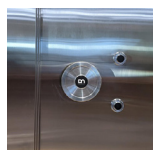
DN Vault Doors