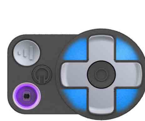
LED and RGB Feature

Learn more at https://www.dieboldnixdorf.com/DNSeriesEASYNAB/