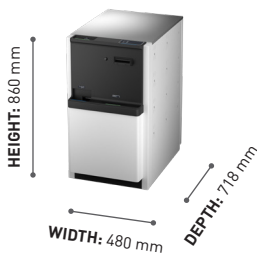
Cash Rack Height: 860 mm Width: 480 mm Depth: 718 mm