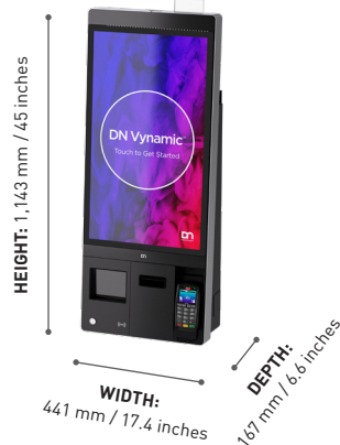
Wall mounted 32"

Height: 997 mm / 39.3 inches Width: 441 mm / 17.4 inches Depth: 167 mm / 6.6 inches