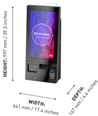
Wall mounted 27"

Height: 997 mm / 39.3 inches Width: 441 mm / 17.4 inches Depth: 167 mm / 6.6 inches