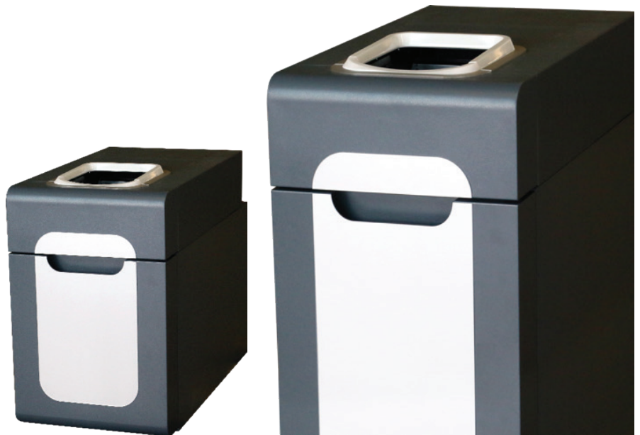
Short: 6, 8 Rolled Storage Modules

The Solo compliments our complete line of teller automation solutions, providing you with a number of options.