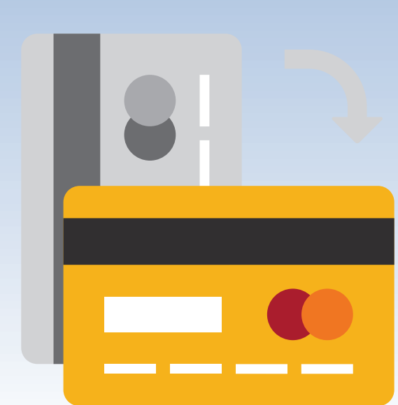
1. Rotate Card 90°