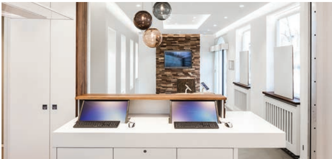
A view from the redesigned teller's station