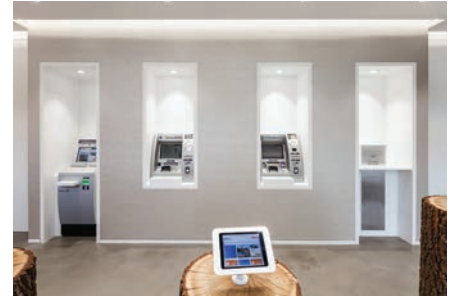
A brighter and more open self-service zone

Marked by a dark entrance, the previous design of VR-Bank Werdenfels' 25-year-old branch in Oberammergau prevented the bank from offering the best possible consumer experience. VR-Bank Werdenfels reached out to Diebold Nixdorf for help in designing a bright, open layout that would serve both its consumers and employees well. Drawing inspiration from the community's rich natural surroundings, Diebold Nixdorf and VR-Bank Werdenfels collaborated to maximize the space's potential and create a vibrant design that has been a boon to both the bank and its consumers.