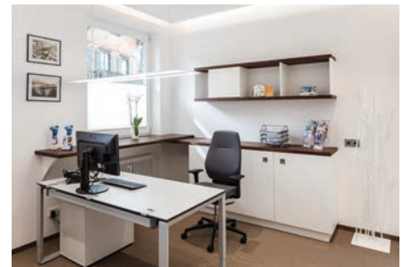
A redesigned consulting room