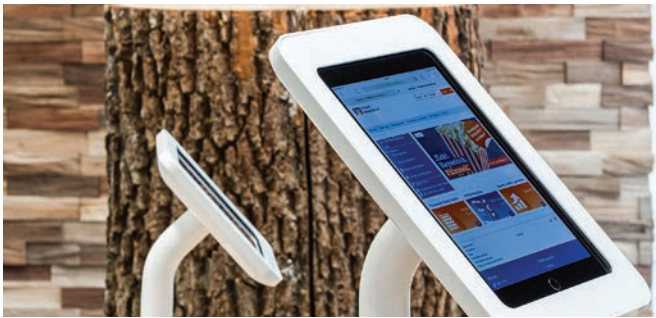
The 140-year-old oak tree trunks adorned with iPads

After hours, the area is covered by a roller shutter. "This was the most reasonable option to secure the foyer because it requires minimal maintenance," explained the architects of Diebold Nixdorf, who planned and oversaw the project.