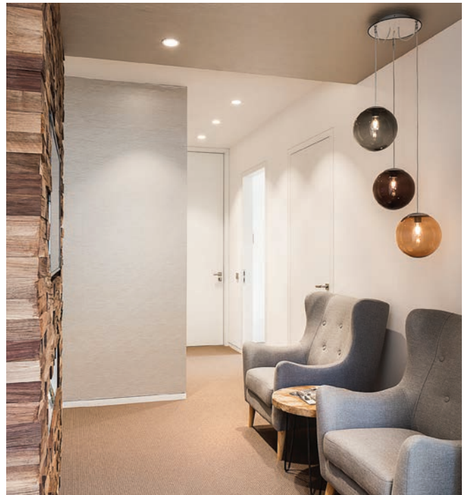
The new customer waiting area

"The customers are accepting the branch well. The consultation appointments take place in a much more pleasant atmosphere."